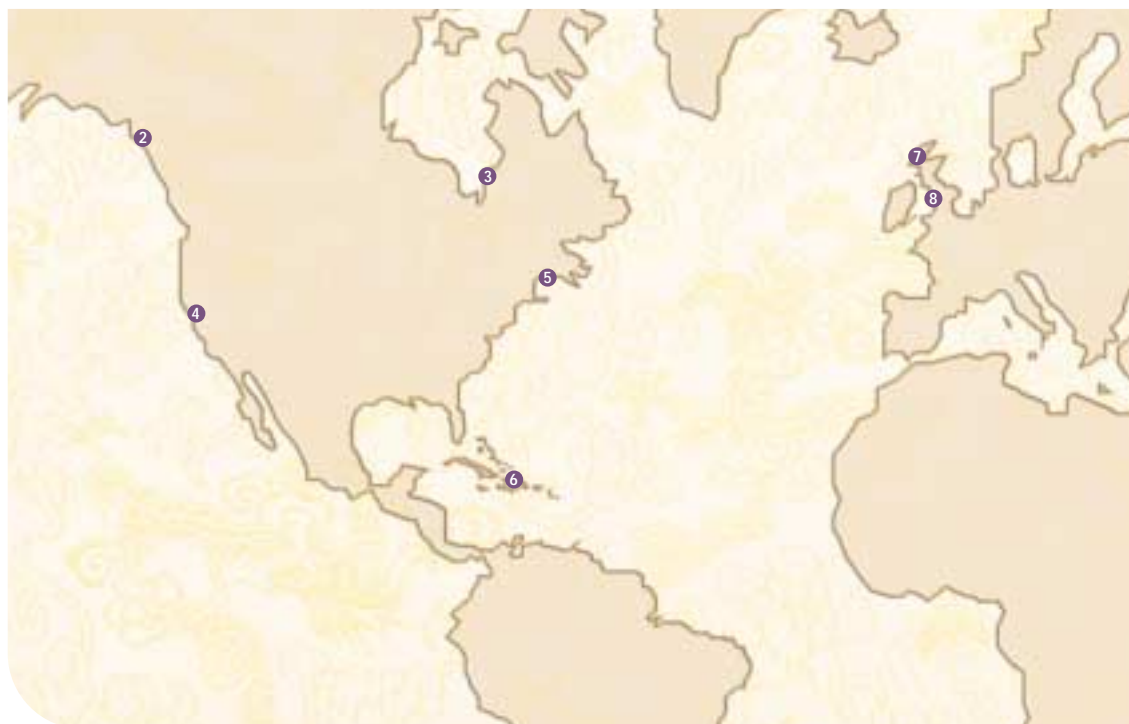
東亞銀行約 160 個營業地點服務全球客戶。

東亞銀行一直緊貼市場情況，以滿足客戶不斷轉變的需求，服務範圍包括企業銀行、個人銀行、投資銀行及中國業務。本行提供全面的零售及批發銀行服務和產品，包括存款、外幣儲蓄、樓宇按揭貸款、私人貸款、信用卡產品、電子網絡銀行服務、強制性公積金服務、貿易融資、銀團貸款、匯款及外匯孖展交易等。東亞銀行將持續服務香港、中國及海外客戶，致力提高其作為香港主要金融機構之一的地位。