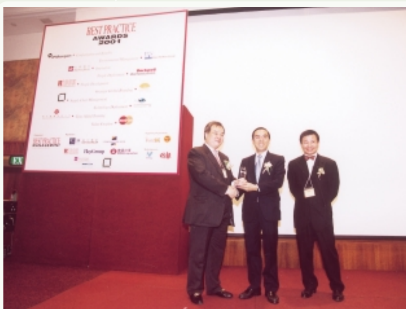
Dah Sing won the "Best Practice Award 2001 - Innovation". 大新奪得二零零一年度「最佳業務實踐獎 - 創新意念」。

Our retail banking product innovation, an accomplishment of the joint effort of many divisions including Operations and IT, was also recognised in the year through our receiving the Best Practice Award for Innovation given by Best Practice Management, a best practice benchmarking and publication organization focusing on sharing best practice knowledge to businesses, government and non-profit organizations in Asia.