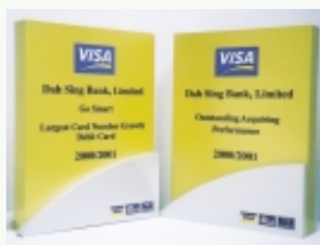
Dah Sing received awards from both MasterCard and Visa for its credit card business for 2001.

With a further tightening in the spread earned on mortgage lending, we decided to concentrate our effort on growing the government guaranteed Home Ownership Scheme mortgages and maintained a stable residential mortgage pool. A strong growth in personal loans was achieved in the year.