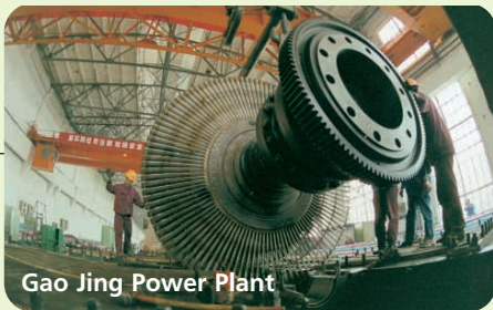
Gao Jing Power Plant