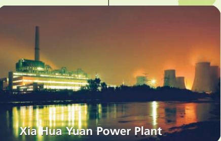
Xia Hua Yuan Power Plant