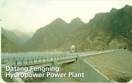
Datang Fengning Hydropower Power Plant