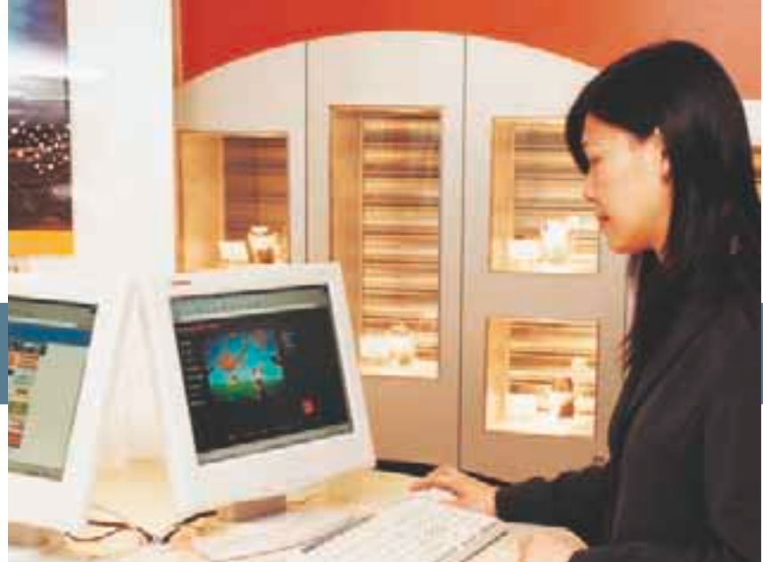
At Hutchison Telecom's flagship store in Macau, customers can access the Internet at the specially designed "Information Corner" and obtain the latest updates on mobile products and services.