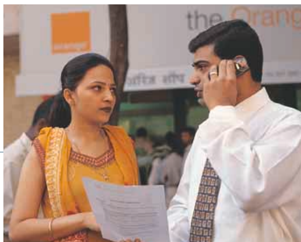
Mobile phones are becoming increasingly popular in India. There are over 6 million subscribers in the country with a growth rate of over 5% a month.

In India, the Group's 2G telecommunications operations consist of 49% interests in four operations: Hutchison Max Telecom in Mumbai, Sterling Cellular in Delhi, Usha Martin Telekom in Kolkata and Fascel in the province of Gujarat. In the second half of 2001, the Group's joint venture with the Essar Group successfully acquired three additional mobile licences, for a total of US$99 million, in the provinces of Karnataka (includes Bangalore city), Andhra Pradesh (includes Hyderabad city) and in the city of Chennai, which are scheduled to commence operations in mid 2002. In this rapidly growing mobile telecommunication market, the four existing operations recorded an impressive 81% growth in their combined subscriber base in the year, which currently totals over 1.2 million and the reported EBIT was almost double that of last year.