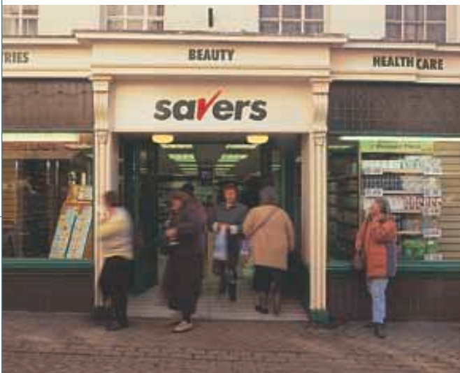
Savers health and beauty chain continues to grow swiftly in the UK, providing great value and convenience to consumers.

The Group's principal investment is a 20% interest in Procter & Gamble-Hutchison which manufactures and distributes a range of hair-care, skin-care, soap, detergent, dental hygiene and paper products throughout the