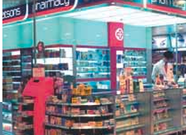
Watsons Your Personal Store has maintained its position as the most recognised health and beauty retailer in Asia.