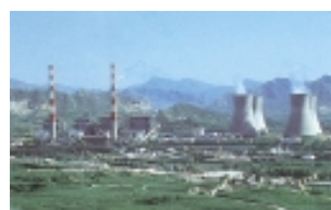
Shangan Power Plant 1,300 MW