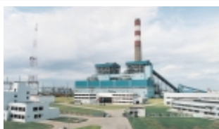
Shanghai Shidongkou Second Power Plant 1,200 MW