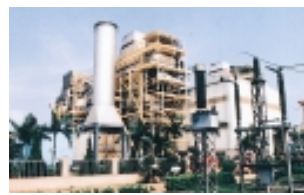
Shantou Combined Cycle Power Plant 100 MW