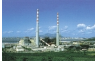
Dalian Power Plant 1,400 MW