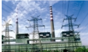
Nantong Power Plant 1,400 MW