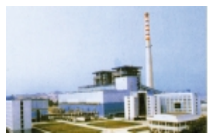
Shantou Coal-fired Power Plant 600 MW