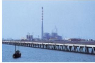
Dandong Power Plant 700 MW