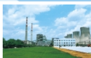
Dezhou Power Plant 1,200 MW