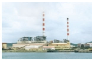
Weihai Power Plant 850 MW