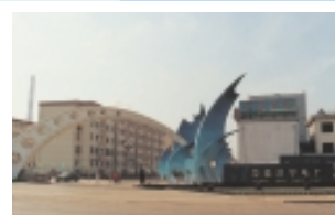
Jining Power Plant 300 MW