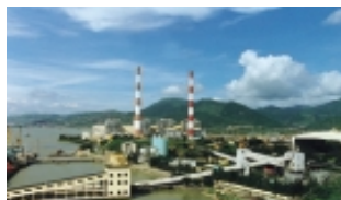
Fuzhou Power Plant 1,400 MW

Nantong Investment Management Centre 1.13%