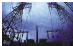
Nanjing Power Plant 600 MW