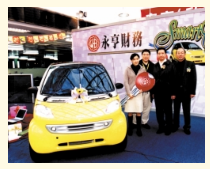
透過永亨財務,集團積極拓展汽車及器材貸款業務。 Through Wing Hang Finance, the Group actively promotes vehicle and equipment financing.

For consumer finance, the Bank has been expanding this area of business through its Credit Card Division as well as Wing Hang Credit Limited.