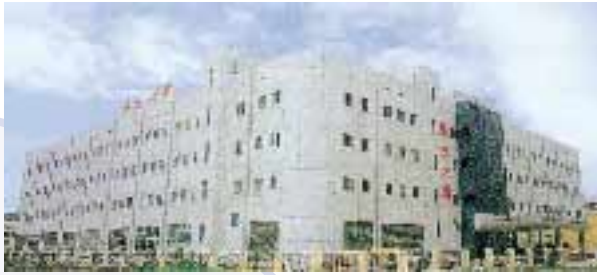
Yuen Sang Building, Danshui, Huiyang