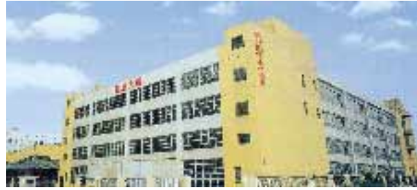
Lambda Building, Danshui, Huiyang