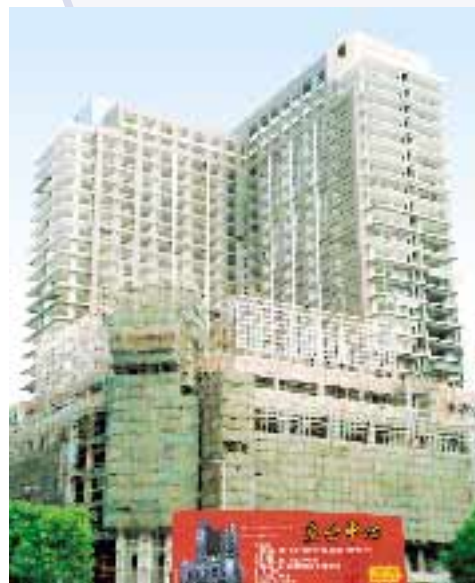
Chengdu Chuang's Centre, Chengdu, Sichuan

Apart from these three printing businesses, the Group acquired the entire interests in Lambda Building, Yuen Sang Building and three blocks of residential units of Chuang's Garden, in Huiyang, the PRC, with an aggregate gross floor area of