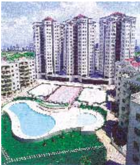
Chuang's Garden, Danshui, Huiyang

sharp cooling effect on world economy and impeded the recovery of Hong Kong's economy. In fact, the local market had a quick response with an immediate cut in marketing budget by our commercial clients since September 2001. As a result, together with other micro-economical factors, it recorded a drastic fell in turnover as compared with last year. With a good reputation in high-quality and prompt delivery, we believe it will pick up its business as soon as the external environment is improved.