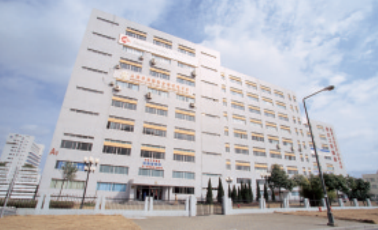
Tomson Waigaoqiao Industrial Park 湯臣外高橋工業園區