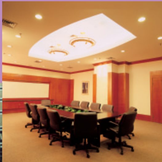
Tomson Financial Building 湯臣金融大廈