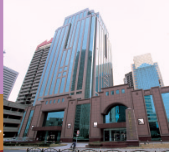
Tomson International Trade Building 湯臣國際貿易大樓