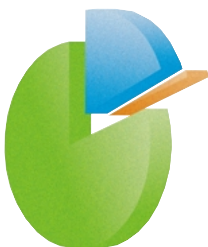
Turnover Breakdown by Countries