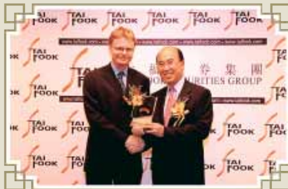
Asiamoney presents "Best Local Equity House Award" to Tai Fook.

The successful implementation of the Total Quality Management (TQM) System has helped raise the Group's service standard to higher plateau, empowering all staff at Tai Fook to meet challenges brought above by competitions in the market-place.