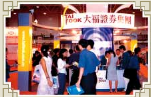
Tai Fook participated in July 2002 "The 3rd China International Internet Exhibition" held in Shenzhen.

The Group has planned more China networking initiatives in the coming months in second or third liner cities to further enhance Tai Fook's brand awareness.