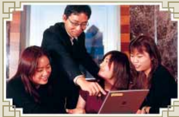
The Group provides a wide range of training workshops to grow the competence of its staff.

Tai Fook is proud to take the lead in setting a good industry practice in regard to the nurture and development of staff. We believe the Group is well placed for any future challenges.