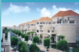
Phase IX of Lexi New City (Green Island House) Shajiao Island, Panyu

Total G.F.A.: approx. 683,000 sq.ft.; 16.36% owned by Group. This project was completed in February 2002.