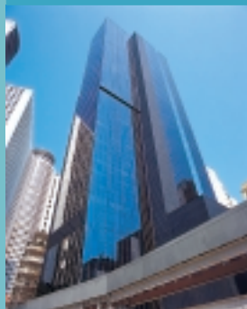
MLC Tower (formerly known as CEF Life Tower), Wanchai

Completed in late 1998 for rental purpose, this 17.13%-owned quality office building consists of 34 storeys that have a total G.F.A. of approx. 335,000 sq.ft.