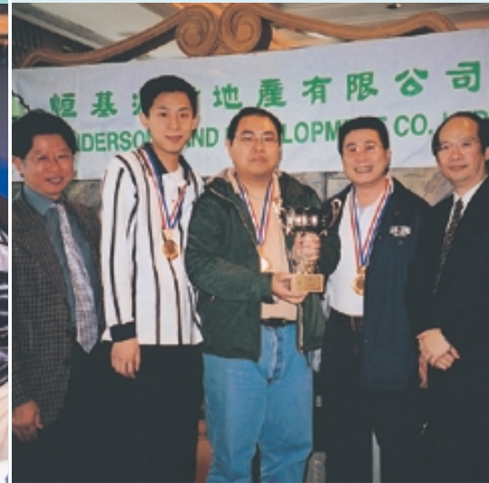
■ Bowling Champions