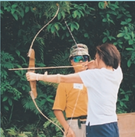
■ Activities at Tai Tong Evening Camp