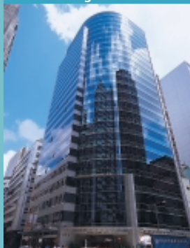
Winning Centre, San Po Kong

This 24-storey industrial building provides a total G.F.A. of approx. 150,000 sq.ft..