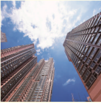
1 Queen's Terrace