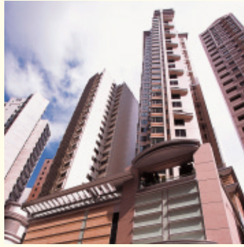
11-15 MacDonnell Road