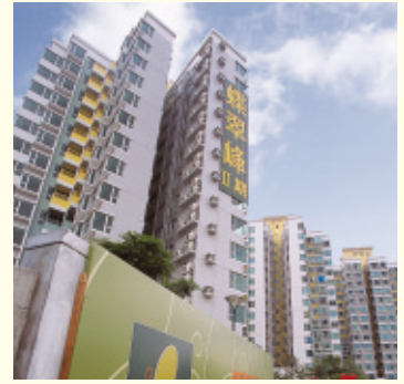
18 Sereno Verde Phase II