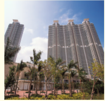
19 Seaview Crescent