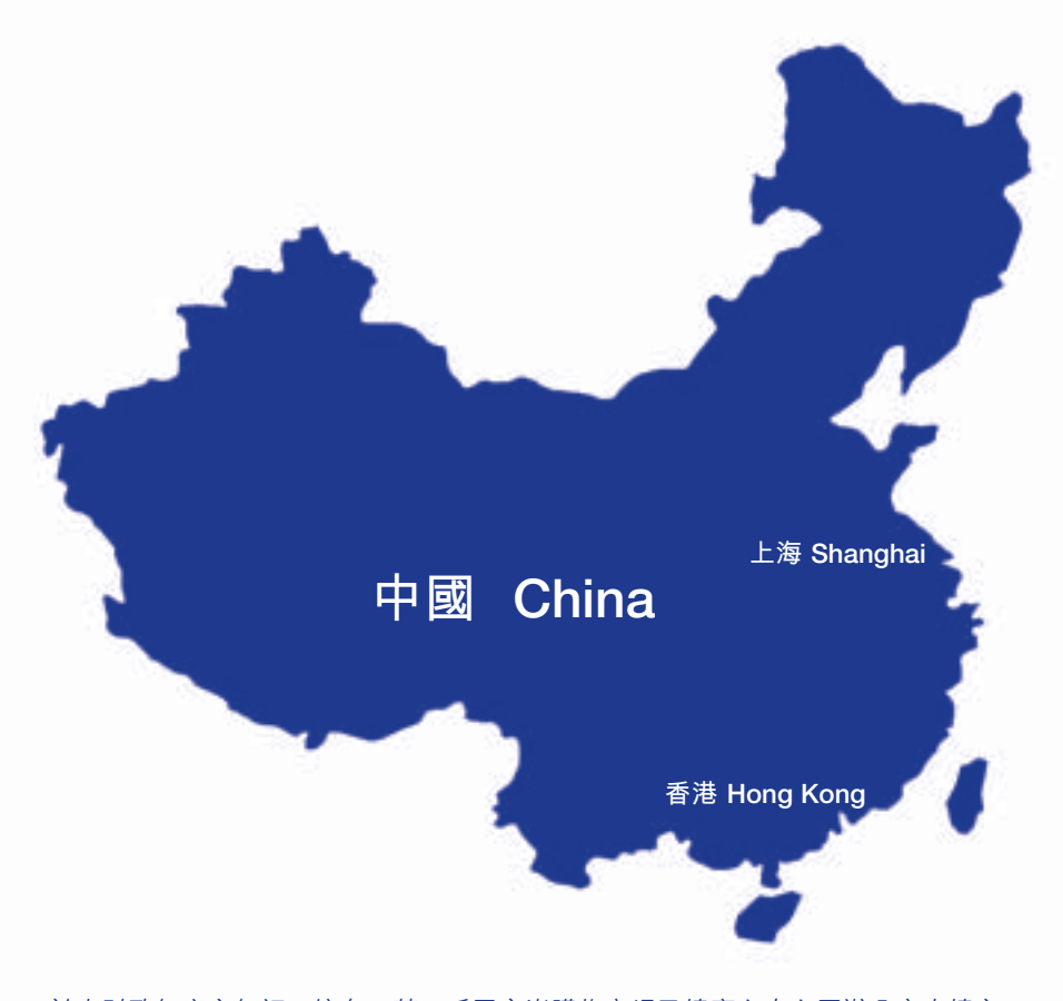
於本財政年度之年初,擁有五萬二千平方米購物商場及樓高六十六層辦公室大樓之 恒隆廣場正式啓業,標誌着本集團在上海另一項新發展,而於一九九九年啓業之港 匯廣場亦同時證明其效益。

The financial year began with the opening of a new key note development in Shanghai -Plaza 66, a 52,000 sg m shopping mall with 66 storeys of offices and verification of the success of The Grand Gateway complex which we opened in 1999.