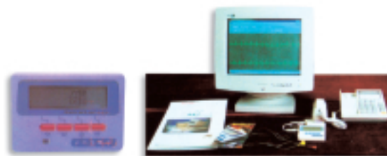
Medical Care Products — MICARD

Following the Group's initial investment at end of last financial year on biotechnology company, further investments were made in the area of medical and health sector on (i) commercial sponsorship of research and development project carried out by the Beijing Medical University on athletic and diabetes drinks to reduce fat level in human blood and improve sports performance of athletics. The research is in its initial stage and expect to last 3 years before commercial production of its end products; (ii) distribution in Asia of a healthcare system which, by deploying a patented micro-nebulization treatment, penetrates every cell in the human body with soluble health substances (e.g. Minerals, vitamins) and revitalize it, thereby retarding the aging process. Programme to enter into China market is underway.