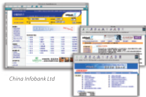
China Infobank Ltd

The Group maintains its 40% interests in China Infobank which possesses one of the largest database of mainland Chinese business information. Users include universities, consultants, finance and banking corporations, professional companies and public relation firms. Efforts are concentrated in business penetration and streamlining operation. The Group continues its investment in web-based software developer.