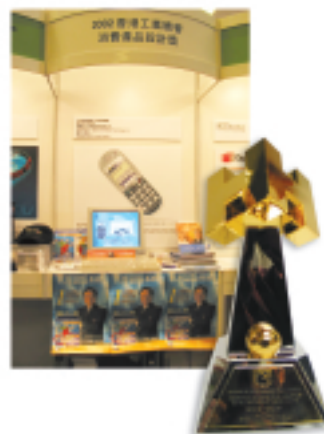
2002 Federation of Hong Kong Industries Consumer Products Design Award

The 32% owned GEM board listed technology investments, Q9 Technology Holdings Limited ("Q9") once again won the 2002 Federation of Hong Kong Industries Consumer Product Design Award by its newly developed Q9 CIS English version. Agreement was established with the Vocational Training Council for Q9 Chinese input skill be a recognized qualification by employers in Hong Kong. Several mobile phone manufacturers, including Nokia (Hong Kong) Ltd, commenced productions of phones with Q9 CIS embedded in September 2002. The company will begin to have licensing fees from these phone manufacturers. In Shangdong Province, Q9 CIS has been endorsed as an educational tool for primary and secondary schools.