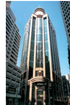
Lee Theatre Plaza 99 Percival Street, Causeway Bay

Total Gross Floor Area: 719,642 sq.ft. Number of Floors : 45 Carparks : 263 Year Completed / Renovated : 1981