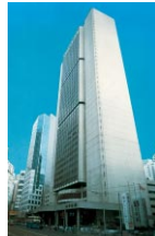
Hennessy Centre 500 Hennessy Road, Causeway Bay

Total Gross Floor Area: 139,119 sq.ft. Number of Floors : 25 Year Completed / Renovated : 1989