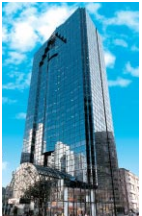
AIA Plaza 18 Hysan Avenue, Causeway Bay

AIA Plaza is a 25-level office and retail complex and is within easy walking distance to the MTR Causeway Bay station. The building boasts a bright and spacious lobby, and an array of specialty food and beverage outlets.