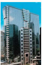
Caroline Centre 28 Yun Ping Road, Causeway Bay

Total Gross Floor Area: 315,749 sq.ft. Number of Floors : 24 (with two basement floors) Year Completed / Renovated : 1995