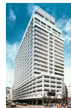
Leighton Centre 77 Leighton Road, Causeway Bay

Total Gross Floor Area: 902,797 sq.ft. Number of Floors : 53 Carparks : 200 Year Completed / Renovated : 1997