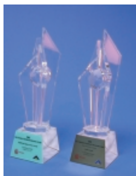
Best Corporate Governance Disclosure Awards 2002

Management's commitment to excellence has continued to gain market recognition from different stakeholders including bankers, analysts and institutional investors.