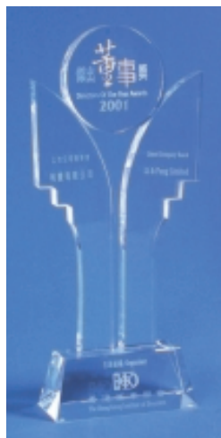
Directors of the Year Awards 2001