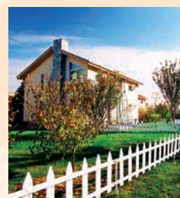
華中園 Woodland Villa