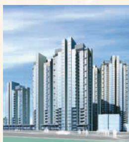
董家渡項目 Dong Jia Du project