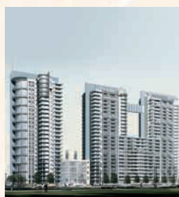
峻峰華亭 Top Box