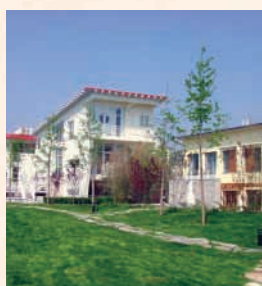
風景翠園 La Firenze Phazse 1

商 — 商業 停 — 停車場 辦 — 辦公室 住 — 住宅 C — Commercial CP — Car Park O — Office R — Residential