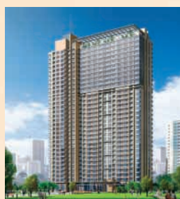
鳳凰城二期 Phoenix City Phase 2