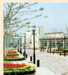
翡翠城二期 La Firenze Phase 2