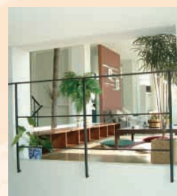
翡翠城一期 La Firenze Phase 1