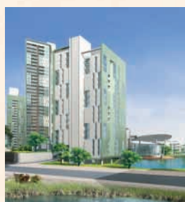
東湖項目 Dong Hu project

商 — 商業 停 — 停車場 辦 — 辦公室 住 — 住宅 C — Commercial CP — Car Park O — Office R — Residential