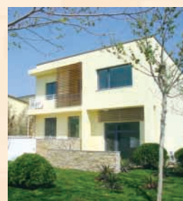
風景翠園 La Firenze Phase 1