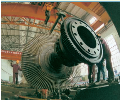
1 Gao Jing Power Plant