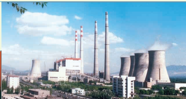
3 Zhang Jia Kou Power Plant