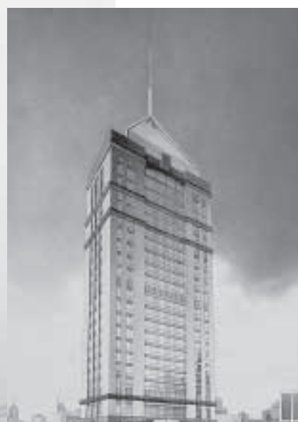
An elevation design of the building. 擴初設計大樓外貌。

在上海之華美國際酒店商務樓，位於上海西藏路繁忙地帶，擁有二百三十四個單位及購物中心。