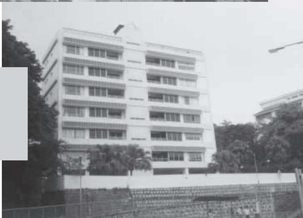
Modreenagh, 3-5 Plunkett's Road, the Peak, Hong Kong.

香港山頂加列山道七十二號 「Chateau Vivienne」，多個 豪華覆式單位住宅物業。