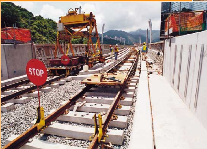
Permanent Way for East Rail Extensions