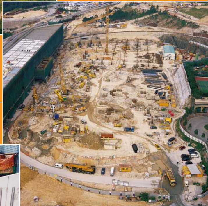
Public Transport Interchange at Wu Kai Sha Station