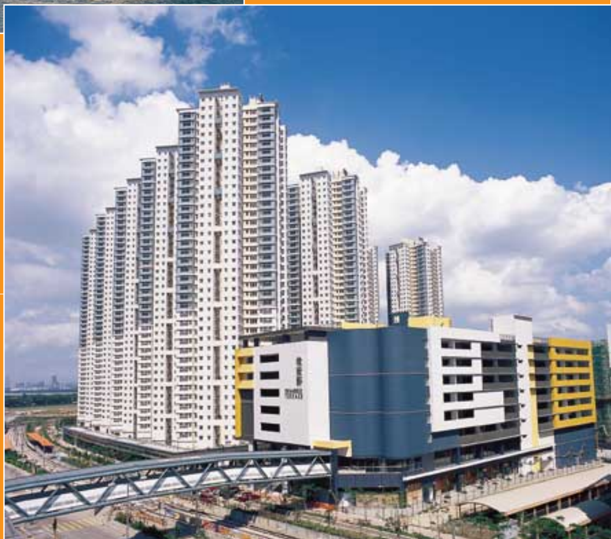
PPS at Tin Shui Wai