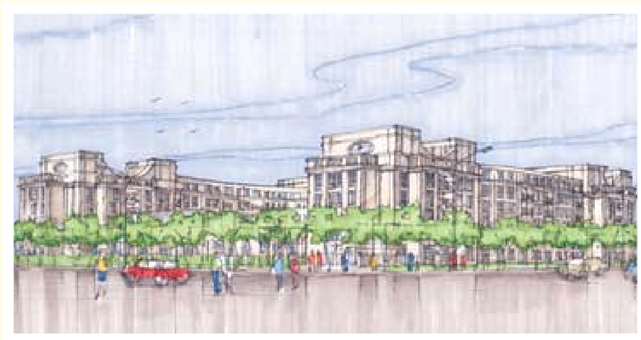
Artist's rendering of the Group's future development at Markham, Toronto, Canada.