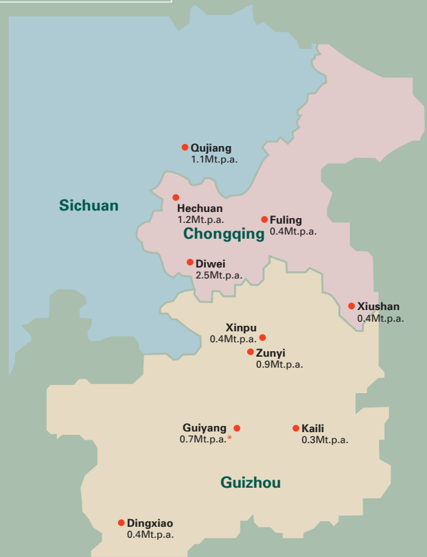
Figures indicate annual production capacity in million tonnes * In the process of concluding this joint venture agreement

The Central Government's "Go West" policy will continue to fund major infrastructure projects in the region, which in turn will boost the demand for high grade cement. Expansion of our existing operations alone will add another 3.5 million tonnes to the Group's annual capacity within the next two years. Our leadership in Chongqing and Guizhou will enable us to expand quickly into nearby provinces that are also undergoing rapid development.