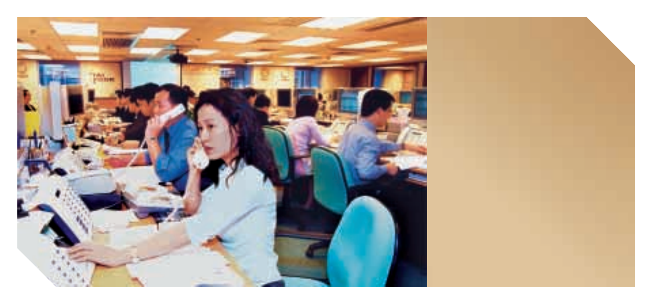
Tai Fook's sales professional are well equipped to provide our customers with excellent financial services.