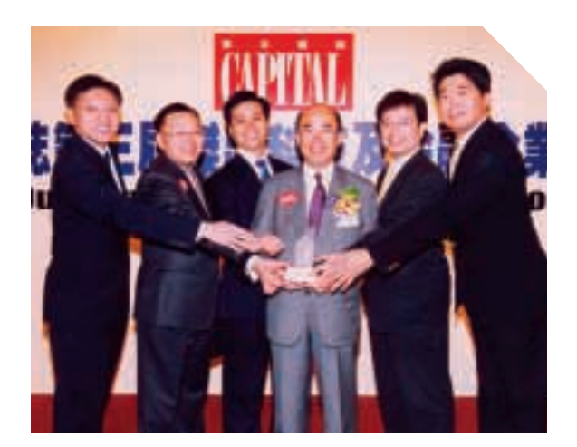
Tai Fook was awarded "The Best Brokerage Company" by Capital magazine.

version of ISO certification. Tai Fook's distinguished achievement in the local financial industry has led to the award of "The Best Local Equity House" by prominent international and local financial publications – Euromoney, FinanceAsia, Asiamoney and Capital Magazine for four consecutive years. The Group's success in the information technology area has been recognized by the renowned IT magazine CIO which elected Tai Fook as one of the "CIO