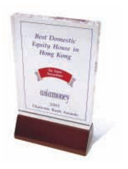
Tai Fook has been awarded "Best Domestic Equity House Award" for two consecutive years by renowned financial magazine, Asiamoney.