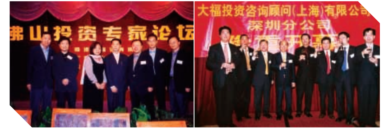
Tai Fook organized various educational investment seminars in several major cities of Mainland China.