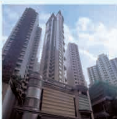
11 MacDonnell Road