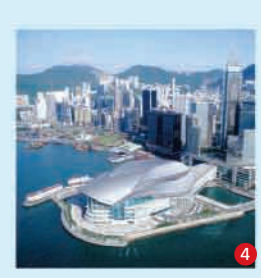
Hong Kong Convention & Exhibition Centre