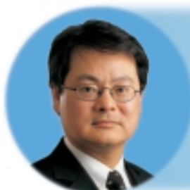
Coven Hui Head - Internal Audit