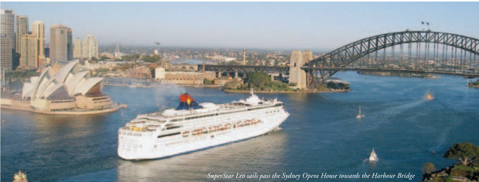
SuperStar Leo sails pass the Sydney Opera House towards the Harbour Bridge

What was a turbulent start to the year did end on a high note as the Company celebrated its tenth year of operations. A decade of great cruising has passed since we commenced operations with a single ship out of Singapore in 1993. Today Star Cruises is the leading cruise line in Asia-Pacific and the third largest cruise line in the world. The many notable achievements, awards and "firsts" bear testimony to the phenomenal growth of the Company in a relatively short span of time through an effective combination of modern technology, innovative cruise