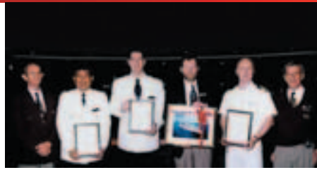
Captain and officers of SuperStar Virgo proudly display the Australian Quarantine and Inspection Services (AQIS) Certificates of Commendation with AQIS sea port officials.

Our priority in this vital area of operations was made all the more significant when Star Cruises became the first cruise company in the world to be issued an