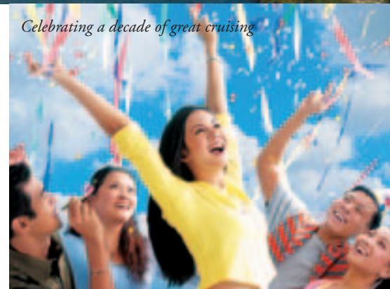
Celebrating a decade of great cruising

This endorsement is a recognition of the excellent health management system placed onboard our ships.