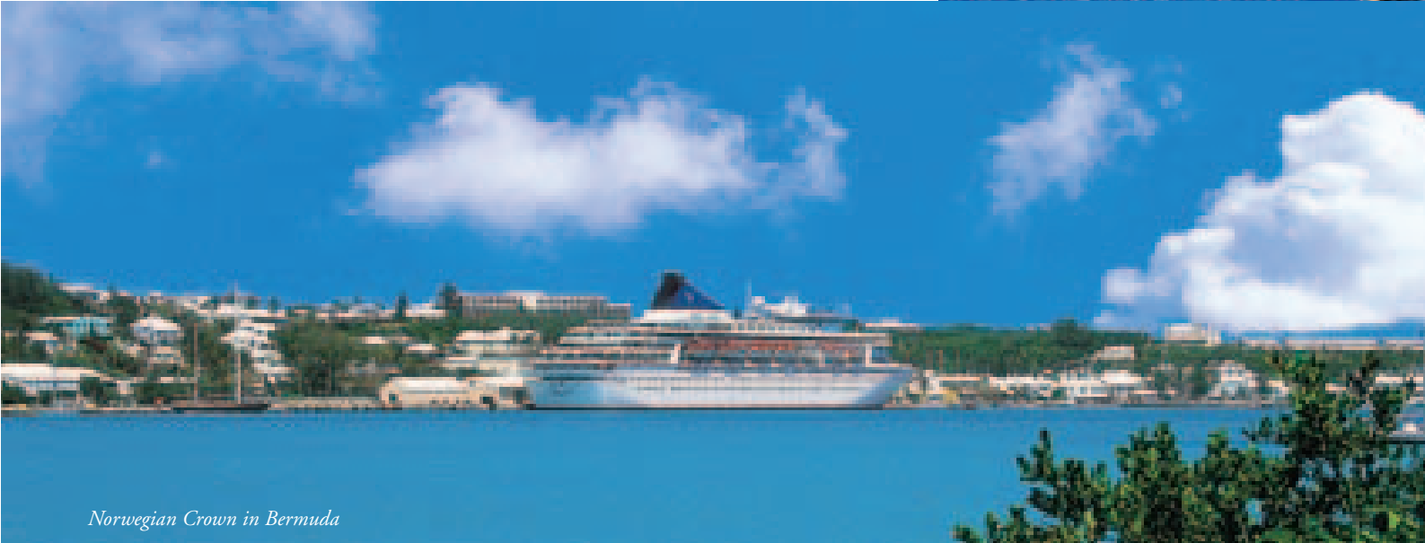
Norwegian Crown in Bermuda