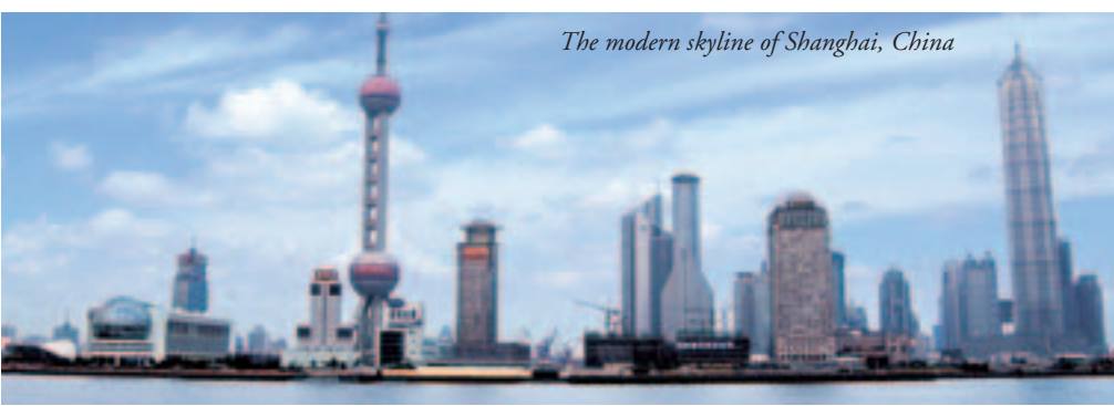
The modern skyline of Shanghai, China

concepts, prudent financial policies and a dynamic workforce.