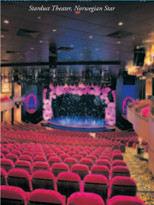
Stardust Theater, Norwegian Star

older Star Cruises vessels in high growth markets in Asia as NCL's newbuilds are introduced into the North American market. Towards this, SuperStar Capricorn and SuperStar Aries have been sold with the latter to be delivered in April 2004.