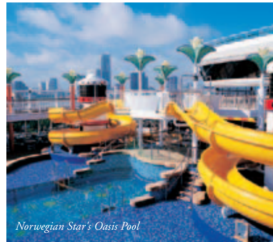
Norwegian Star's Oasis Pool

The strategy would see the transfer of medium capacity NCL ships to replace