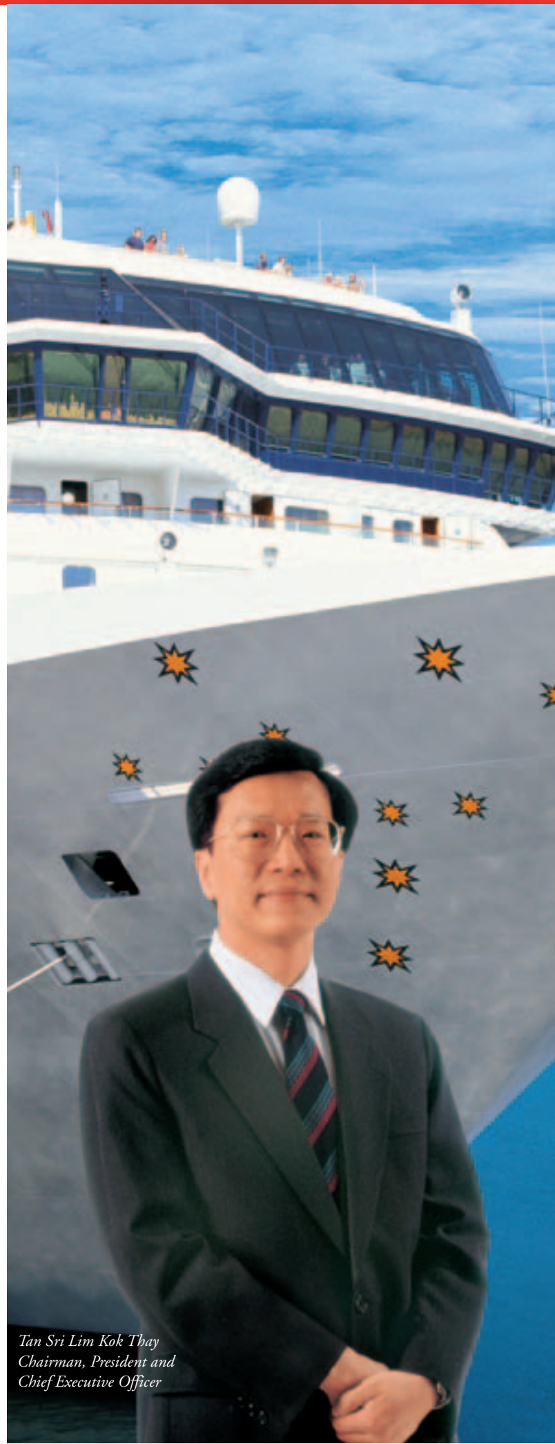
Tan Sri Lim Kok Thay Chairman, President and Chief Executive Officer

Itineraries to China were highlighted by special back to back and overnight cruises from Hong Kong to Shanghai on SuperStar Leo as well as a maiden call to the port of Ningbo.