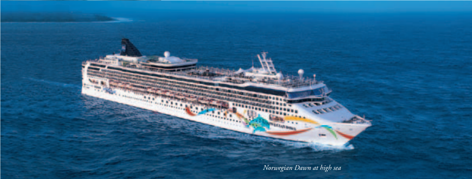
Norwegian Dawn at high sea

Hawaii continues to be a key focus in NCL's strategic positioning. Early in 2003 NCL successfully sought US Congressional approval to operate up to three modern European-built