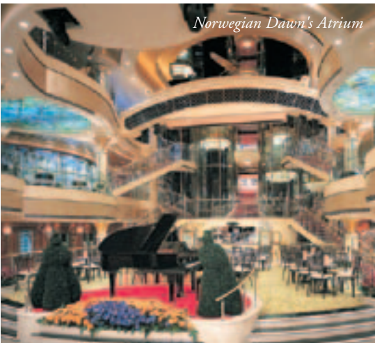
Norwegian Dawn's Atrium