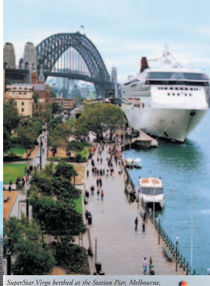
SuperStar Virgo berthed at the Station Pier, Melbourne, Australia in April 2003