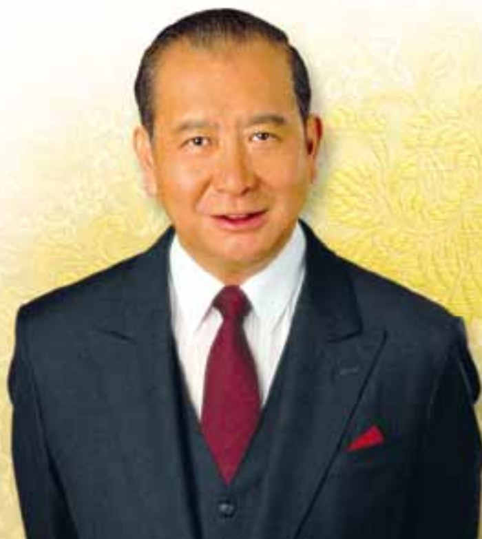
Dr. The Hon. David Li Kwok-po Chairman and Chief Executive 主席兼行政總裁 李國寶博士

The year 2003 presented a difficult environment for the Hong Kong banking industry, particularly following the outbreak of Severe Acute Respiratory Syndrome ("SARS") in the first half of the year. Banks in Hong Kong had to deal with worsened credit quality, sluggish loan demand and depressed market sentiment. The outlook for 2004 remains challenging, although it is generally expected that economic recovery will gather pace in 2004. In view of the keen competition in the Hong Kong banking industry, banks will continue to explore new revenue and profit streams. In addition, following the SARS outbreak and the