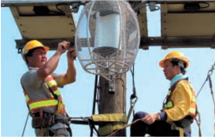
Working on our renewable energy radio repeaters