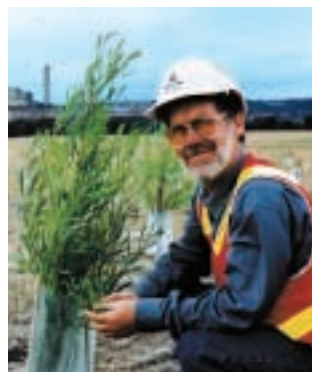
“Greening” at Yallourn Energy