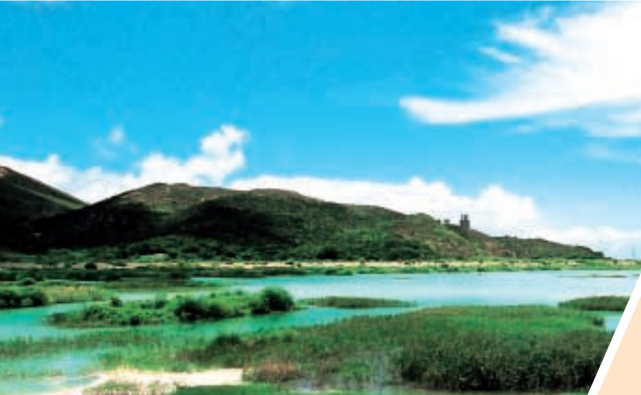
Ash lagoon near Castle Peak Power Station

100% compliance with environmental regulations in Hong Kong