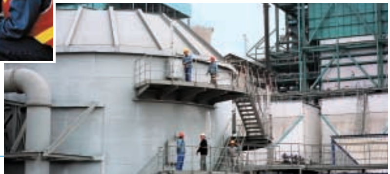
FGD plant at Beijing Yire Power Station