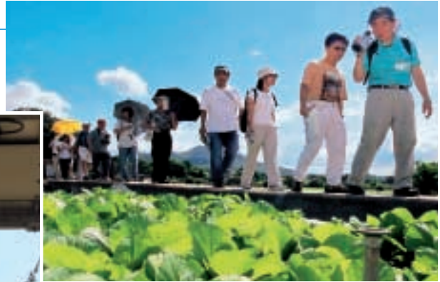
CLP-sponsored Eco Tour in Hong Kong