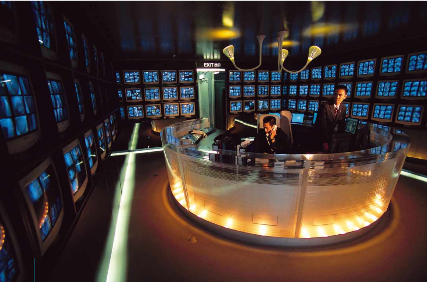
The intelligent heart of an intelligent building – Two IFC's control centre