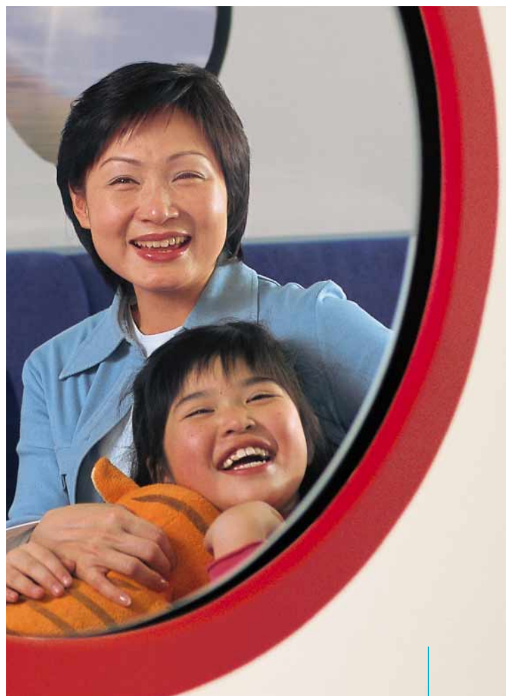
When Disney opens, the fun will begin on the train

Negotiations and the preliminary design were substantially completed for a new station to be constructed at the end of