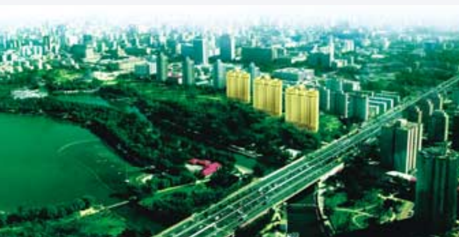
Bird's Eye View of Yu Yuan Tan Apartment (Graphics of Artist's Impression)

#Note : The total GFA of Central Holiday Inn amounted to 49,503 sq. m., in which hotel accounted for 39,079 sq. m. and the office and ancillary facilities accounted for 10,424 sq. m.