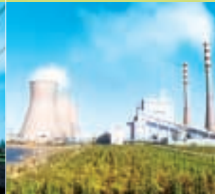
Datang Tuoketuo Power