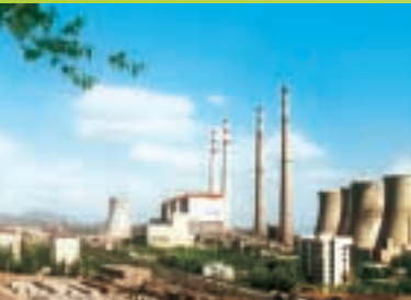
Zhang Jia Kou Power Plant