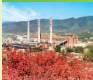
Gao Jing Power Plant