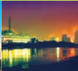
Xia Hua Yuan Power Plant