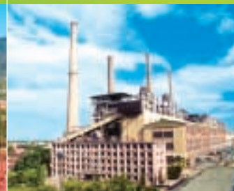
Dou He Power Plant