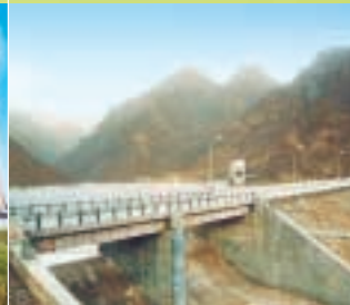
Datang Fengning Hydropower