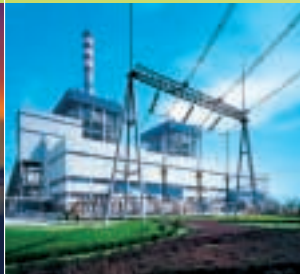
Datang Panshan Power