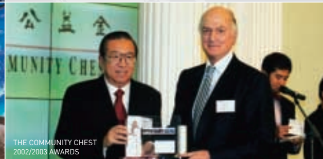
THE COMMUNITY CHEST 2002/2003 AWARDS