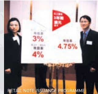
RETAIL NOTE ISSUANCE PROGRAMME