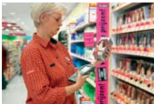
Wireless handheld terminals are widely used by Kruidvat staff to keep track of stock flow.

Hutchison Harbour Ring ("HHR"), a 61.97% owned subsidiary, is listed on the SEHK and is a leading toy manufacturer as well as a supplier and manufacturer of consumer electronic products. The company also holds a number of investment properties in the Mainland. HHR announced turnover including its share of associated companies turnover, of HK$2,208 million and profit attributable to shareholders of HK$128 million, an increase of 18% and 30% respectively, mainly due to increased sales of consumer electronics products, such as mobile handset accessories.