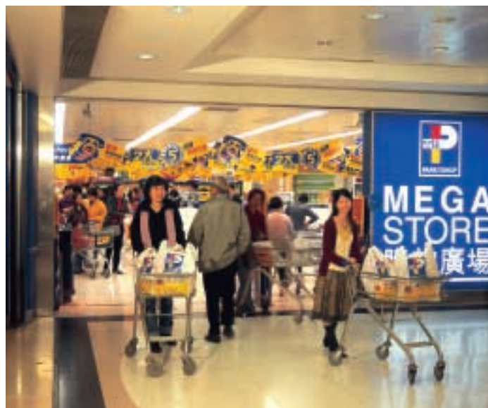
■ PARKnSHOP's megastore concept combines variety, value, convenience and shopping comfort for Hong Kong consumers.

The PARKnSHOP supermarket chain in Hong Kong continued to be affected by the deflationary economy and also SARS. Although it maintained its leading market share and continued to expand in new areas, its sales and EBIT were adversely affected. PARKnSHOP's operations in the Mainland continued to expand and performed well, reporting increased sales and EBIT. Three additional large format stores were opened during the year and more are planned for this year.