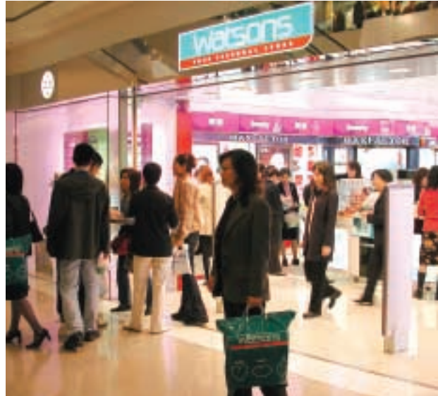
■ The first third-generation store of Watsons Your Personal Store in Admiralty, Hong Kong showcases Watsons' advancements in retail space utilisation and design.

■ A S Watson also manufactures and distributes various water and other beverage products in Hong Kong and the Mainland. Hutchison Whampoa (China) invests in various ventures in the Mainland. Hutchison Harbour Ring is a leading manufacturer of toys and also engages in the design and manufacture of high quality consumer electronic products and accessories. Turnover for the retail and manufacturing division totalled HK$63,086 million, an increase of HK$23,615 million, or 60%, compared to last year, mainly due to the inclusion of a full year of turnover contributed by the Kruidvat health and beauty retail group, including Superdrug in the UK, which was acquired in October 2002. EBIT of HK$2,305 million was 124% above last year (35% above last year on an annualised basis), mainly due to profits contributed by the Kruidvat group, consisting of Kruidvat, Trekpleister, ICI Paris XL, Rossmann and Superdrug, and also improved results from the Group's joint venture with Procter & Gamble in the Mainland and other existing operations in Asia and Savers in the UK.