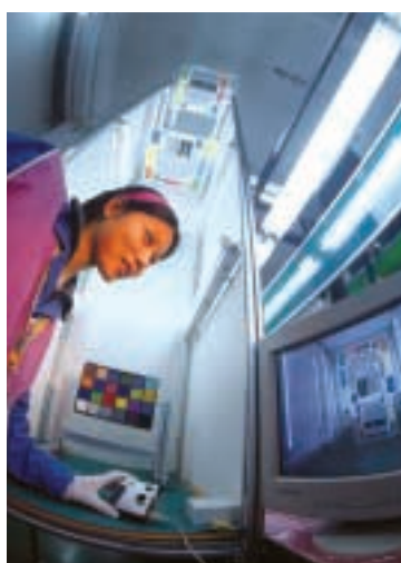
An HHR quality check staff member tests the final assembly of digital cameras to ensure the accurate focusing calibration.