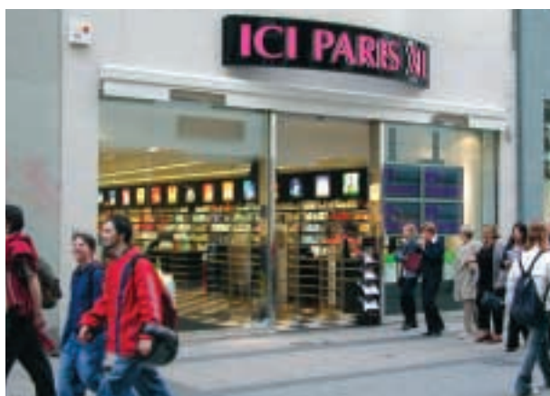
The ICI PARIS XL chain of perfumeries is the market leader in Belgium and also enjoys a high profile in the Dutch market. Each store is characterised by stylish, contemporary design while carrying a full range of luxury fragrances.