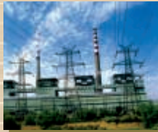
13. Nantong Power Plant (1,404 MW)