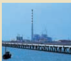
1. Dandong Power Plant (700 MW)