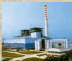
18. Shantou Coal-fired Power Plant (600 MW)