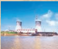
16. Changxing Power Plant (250 MW)