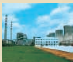
4. Dezhou Power Plant (2,520 MW)