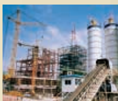
8. Yushe Power Plant (200 MW)