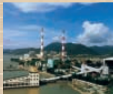
17. Fuzhou Power Plant (1,400 MW)