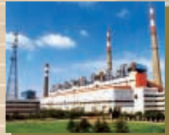
15. Shanghai Shidongkou First Power Plant (1,200 MW)