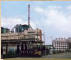
11. Huaiyin Power Plant (400 MW)