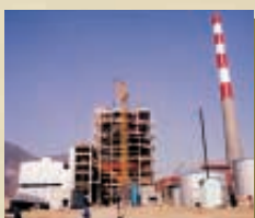
9. Qinbei Power Plant (under construction)