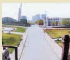
6. Xindian Power Plant (450 MW)