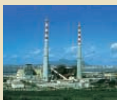
2. Dalian Power Plant (1,400 MW)