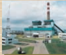
14. Shanghai Shidongkou Second Power Plant (1,200 MW)