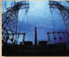
12. Nanjing Power Plant (640 MW)