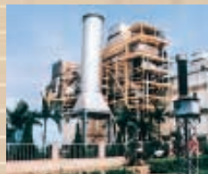
19. Shantou Combined Cycle Power Plant (103 MW)