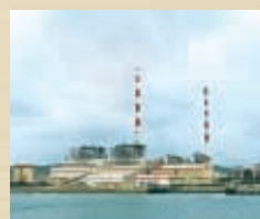
5. Weihai Power Plant (850 MW)