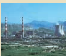
3. Shang'an Power Plant (1,300 MW)