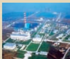
10. Taicang Power Plant (600 MW)