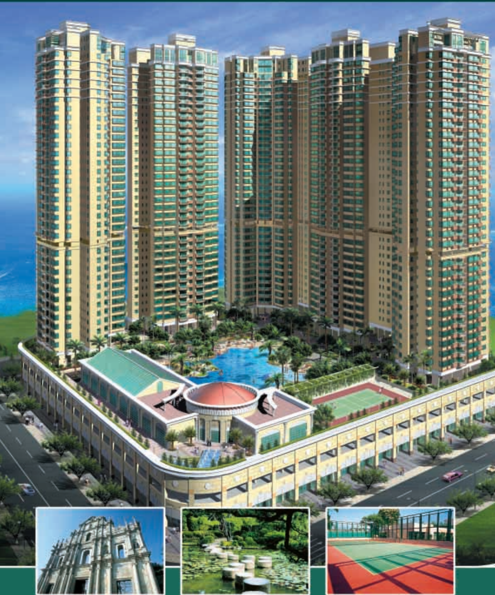
La Baie Du Noble in Macau is a luxury coast-front property development. 澳門之海名居乃矗立於海邊之豪華住宅物業發展項目。