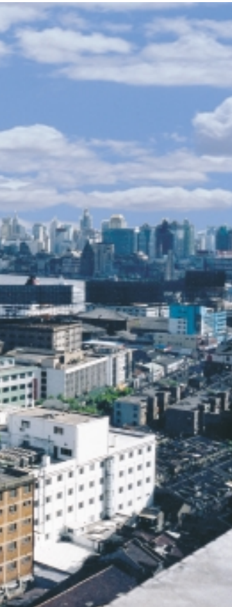
Headquarters of the Company