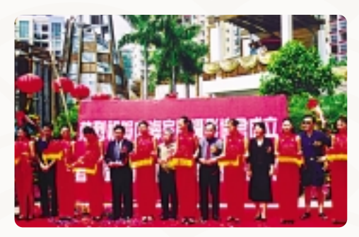
China Overseas' Photography Club established

Exercise to keep a healthy mind and body