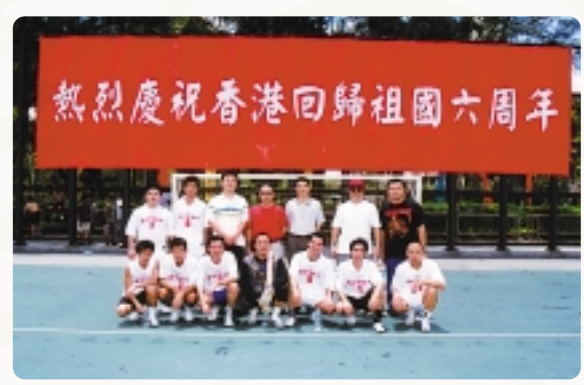
Celebrating the 6th Anniversary of Reunion with China