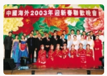
2003 Annual Dinner