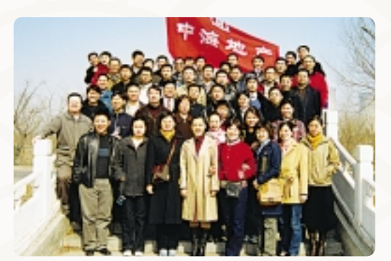
"Spring at China Overseas" Photo-taking activities