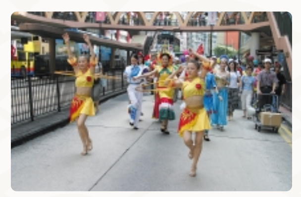
Celebrating the PRC's National Day