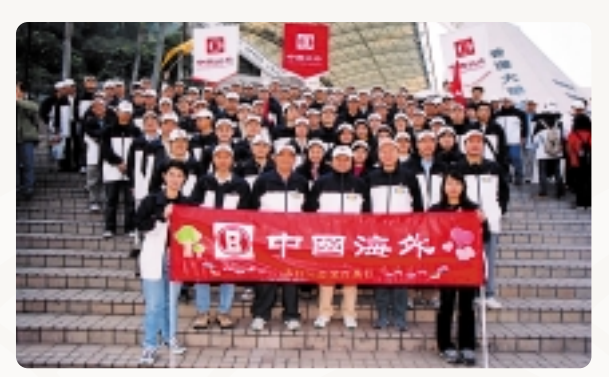
Active Participation in Community Chest's "Walks For Million"