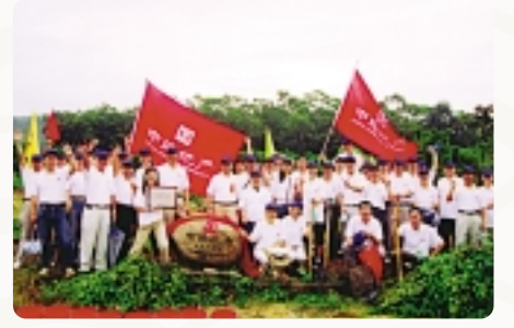
China Overseas' "Green, Environmental Garden" established at Shenzhen