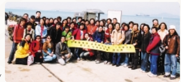
Lamma Trekking Tour to commemorate the International Women's Day