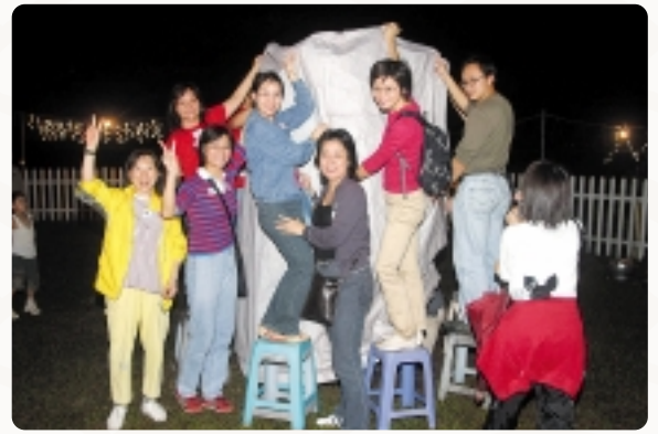
"Kong-ming Lantern" Wish-making outdoor trip