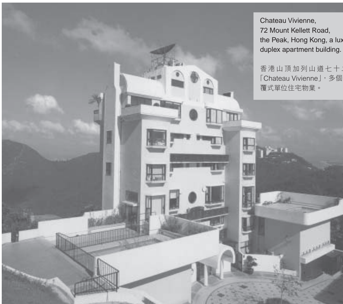
Chateau Vivienne, 72 Mount Kellett Road, the Peak, Hong Kong, a luxury duplex apartment building.

香港山頂加列山道七十二號 「Chateau Vivienne」，多個豪華 覆式單位住宅物業。