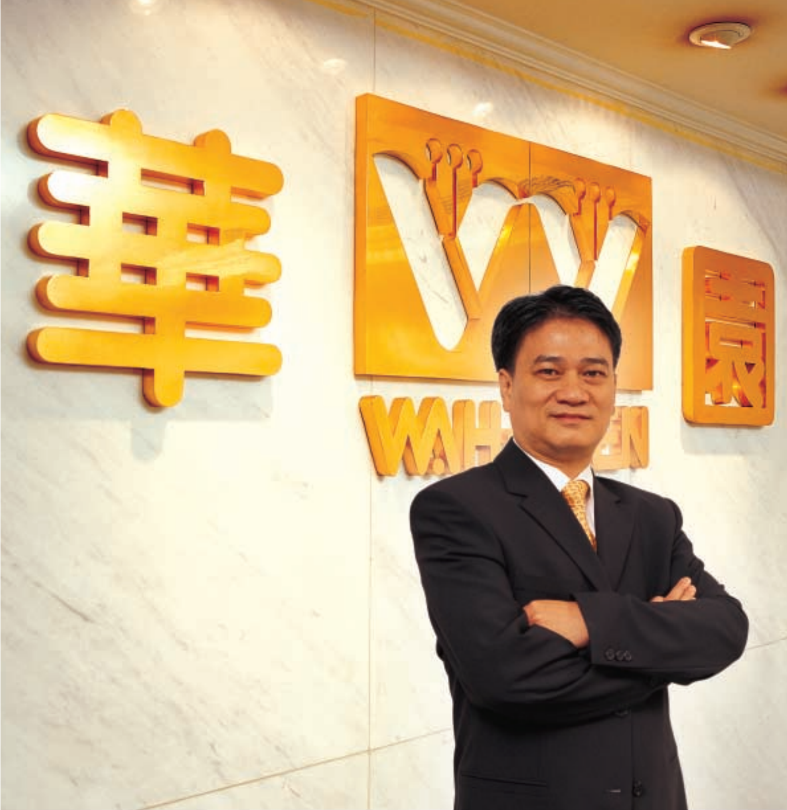
But Ka Wai