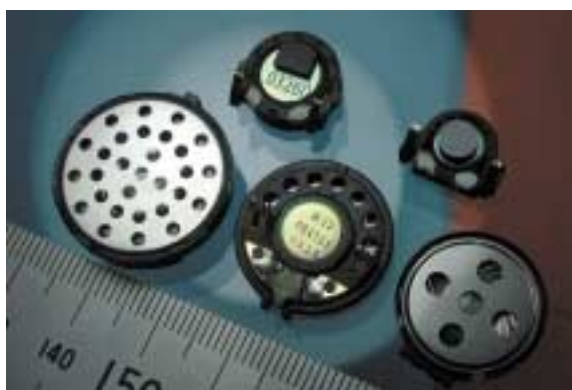
為通訊工業服務之另一EMS項目，移動電話內的微形喇叭 Micro-speakers for Mobile-Phone, another EMS project

At 31 March 2004, the Group's net current assets amounted to HK$150.4 million and the shareholders' equity were HK$280.1 million. The total loan and finance lease was at a low level of HK$51.2 million and the gearing ratio which is defined as total borrowings, excluding minority interests and deferred taxation to shareholders' equity was 0.18. The year-end cash and bank balances were HK$68 million while after net of bank borrowings was HK$20.6 million.