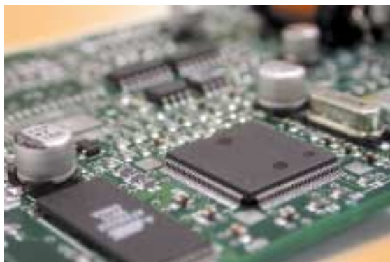
利用表貼工藝之EMS項目 A sample of SMT EMS project

Providing Electronic Manufacturing Services to demanding customers is one of the major contributions to the Group's profit. The success of EMS business depends on the provision of dedicated and pin-pointed management with advanced facilities and production environment control. The Group endeavors to explore new assembling technologies and reliable quality and management systems. The new EMS production plant was opened and new equipment was set up to further facilitate the EMS manufacturing with dustproof clean-room and anti-statistic assembling floors. Advanced SMD mounters, high precision automatic solder paste printer, automatic optical checker, in-circuit tester and nitrogen filled re-flow furnace were also installed. With less headcount of labor resources and higher margin, the result of new EMS projects was encouraging.