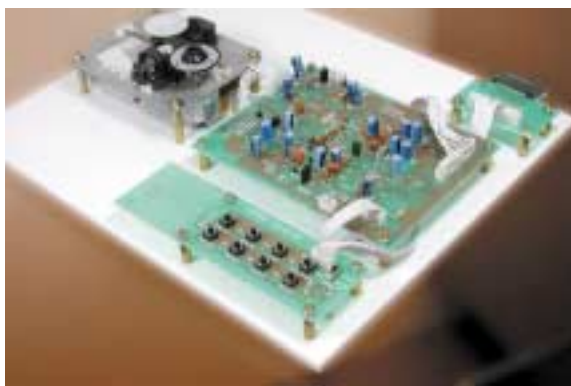
產品設計方案為電子器件分銷客戶的增值服務 Design Solution; Value-Added Distribution Services

The Board of Directors has recommended a final dividend of HK1.0 cent per ordinary share payable to shareholders whose names appear on the Register of Members of the Company on 18 Aug 2004. Subject to the shareholders' approval at the forthcoming annual general meeting, the dividend will be payable on 28 Sep 2004. During this year, an interim dividend of HK1.5 cents per ordinary share amounting to HK$2.4 million was distributed.