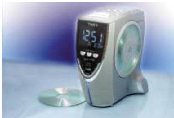
消費類電子產品 ODM Consumer Audio Product

The Group has strong engineering teams in mechanical, electronic as well as software engineering. As one of the few qualified manufacturers of renowned and sizable end buyers such as Wal-Mart and Timex, the Group gained quite a number of new customers and the management expects that business in this aspect would have a reasonable growth in the forthcoming years.