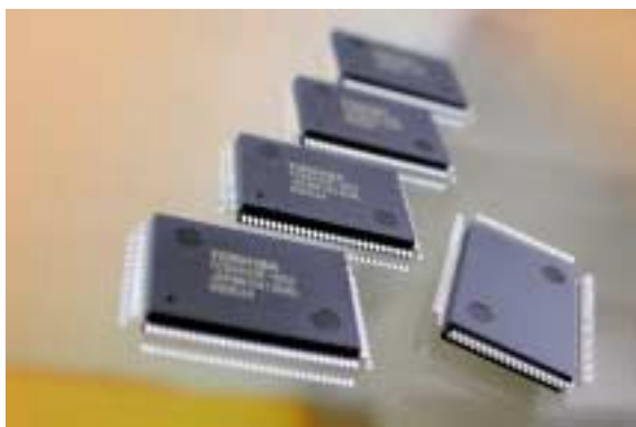
台和經銷的先進半導體器件 Advanced Semiconductor Devices distributed by Daiwa

本集團是香港電子元器件經銷業之其中一領導者，為東芝、松下、安森美(On-Semiconductor)、Lite-on、Sino America Silicon及阿諾德磁材(Arnold Magnetics)之授權經銷商及銷售本集團之品牌COS。集團主要為這些著名品牌經銷集成電路、三極管、微型處理器、分裂及靜態(discrete and passive)電子元器件之市場。此類型電子元器件主要應用於影音產品、電子玩具、電源、家電、空調及其他電子消費產品等。