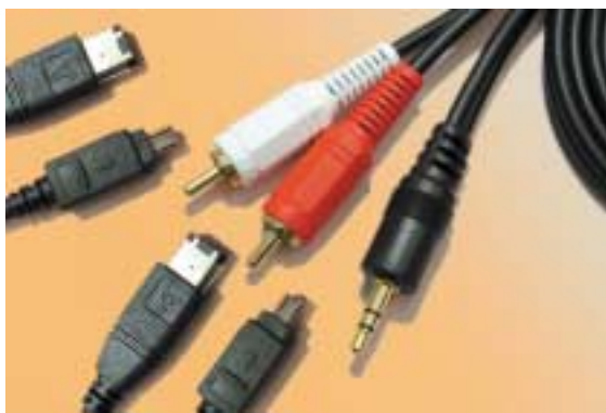
電線產品 Wire Products

製造電線業務在整個集團中仍是處於初階水平。產品主要應用於電子消費產品如電源線、電子線、電腦電線及連接器等，此方面之需求穩定。集團已取得UL、CUL、CCC、VDE、CSA及BS等之國際安全標準證書。產品之品質亦維持穩定，並已開始供應給中國國內之客戶。