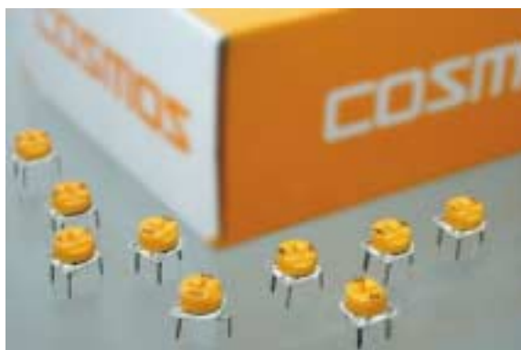
Daiwa's own brand "COSMOS" Variable Resistors 台和自產自銷的「環宇牌」可變電阻

After setting up the EMS production plant with dedicated professional production, management and quality team, the Group has gained good recognitions from existing customers as well as new customers. Not only new projects from exiting customers are moving actively to the Group's EMS plant, the Group has also attracted new EMS customers from Scotland and Japan. The management believes that contribution in this sector will have an aggressive growth in the coming fiscal year.