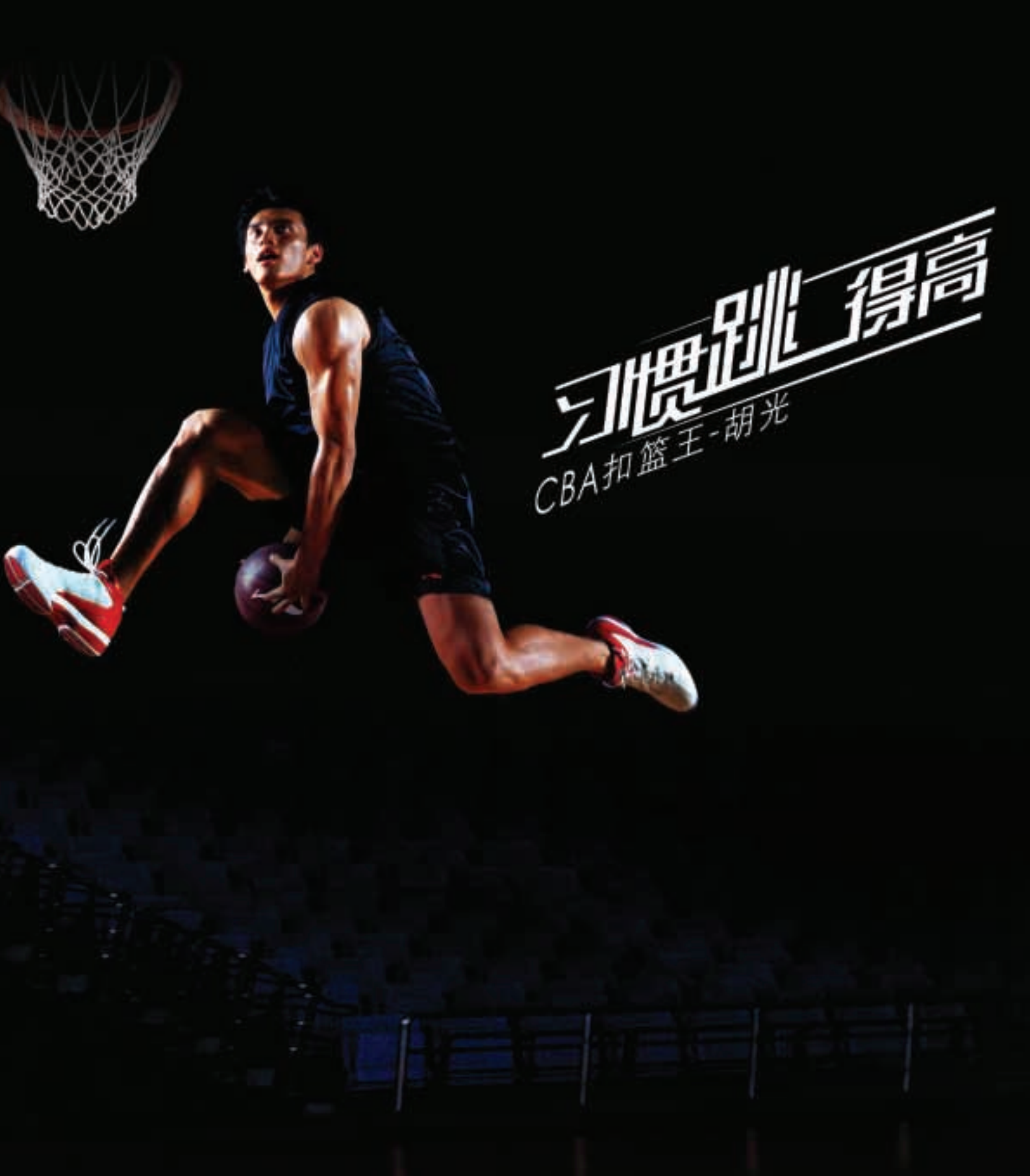
A picture used in our latest marketing campaign, featuring Chinese basketball big-time scorer Hu Guang.