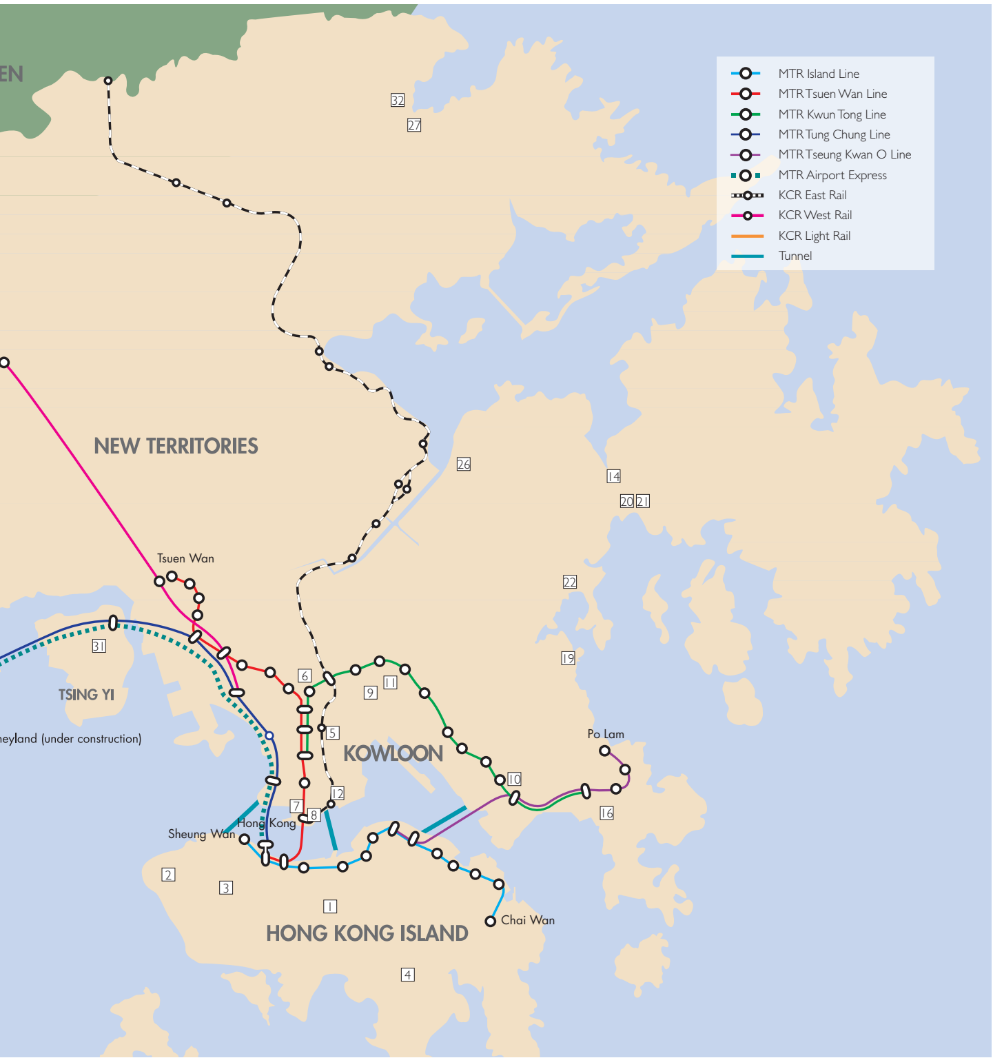
2 Park Road