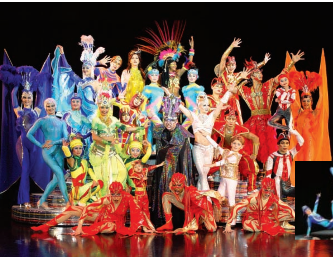
Sorpresa! A new million dollar production show by Star Cruises launched onboard SuperStar Virgo.