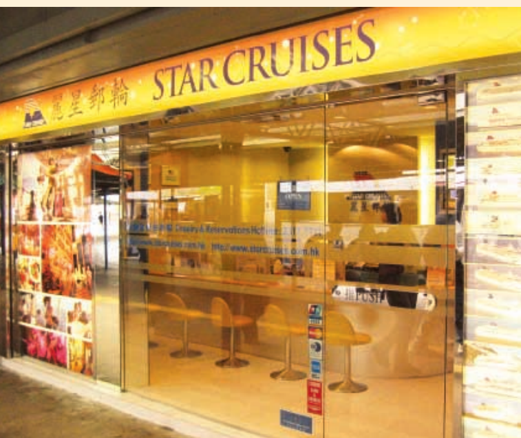
New reservations office at the Tsimshatsui Star Ferry Pier, Hong Kong.