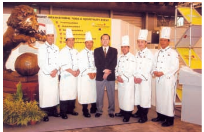
The Star Cruises galley team won a total of 7 medals at the 14th Food Hotel Asia ("FHA") 2004 Culinary Challenge Competition held in Singapore in April 2004.