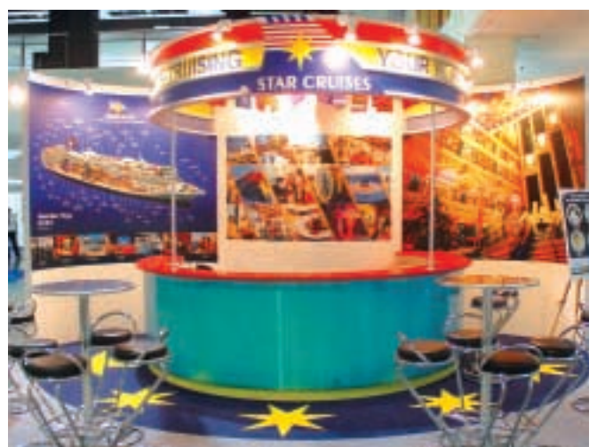
Star Cruises' booth at the Malaysian Association of Tours & Travel Agents ("MATTA") Fair held at the Putra World Trade Centre in Kuala Lumpur on 12-14 March 2004.