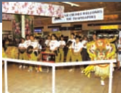
Reunion of Two Sisters – SuperStar Virgo and SuperStar Leo berthed side by side at the Harbour Front Centre, Singapore and the welcoming ceremony on 7 January 2004.