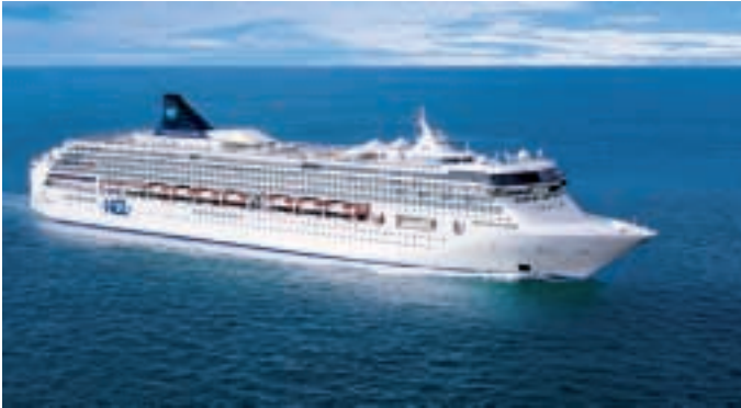
SuperStar Leo now known as Norwegian Spirit sailing in the colours of Norwegian Cruise Line after joining the fleet in May 2004.