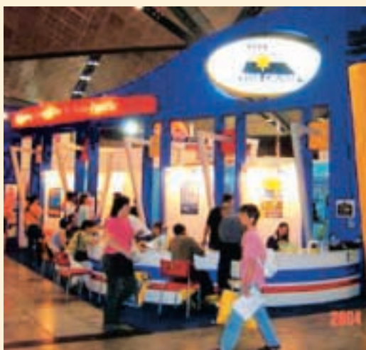
Star Cruises' booth at the National Association of Travel Agents Singapore ("Natas") Travel Fair held at Suntec City Convention Hall, Singapore from 19 to 21 March 2004.