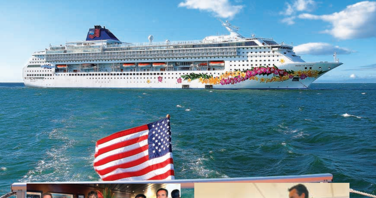
NCL's first US-flagged vessel, Pride of Aloha commenced cruises in Hawai'i, July 2004.