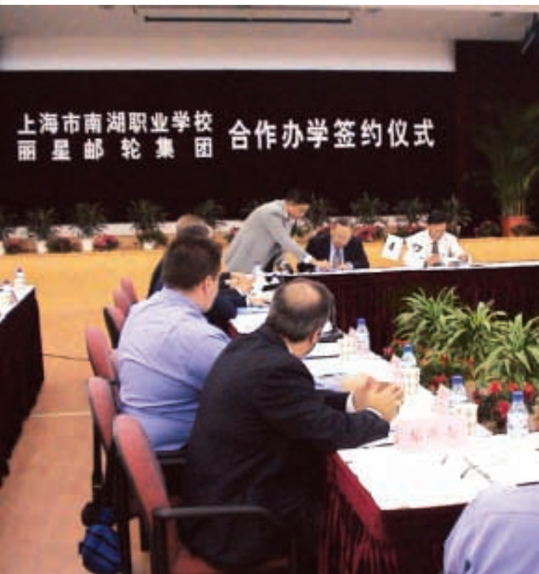
Memorandum Of Understanding (MOU) Signing Ceremony of "Genting-Star International Cruise Management Programme" for youth in Shanghai, China.