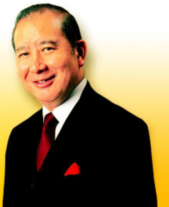
Dr. The Hon. David Li Kwok-po Chairman and Chief Executive 主席兼行政總裁 李國寶博士

At the Annual General Meeting to be held on Friday, 8th April, 2005, the Directors will propose a final dividend of HK$0.80 per share, which, together with the interim dividend of HK$0.28 per share paid in September 2004, will constitute a total dividend of HK$1.08 per share for the full year. This represents an increase of 27.1% over the total dividend of HK$0.85 per share for the year 2003. Shareholders whose names are on the Register of Members at the close of business on Wednesday, 16th March, 2005 will be entitled to the proposed final dividend. The final dividend will be paid in cash, with an option to receive new, fully paid shares in lieu of cash. This scrip dividend scheme is conditional upon the passing of the relevant resolution at the Annual General Meeting, and the Listing Committee of The Stock Exchange of Hong Kong Limited granting the listing of and permission to deal in the new shares. The dividend warrants and the share certificates for the scrip dividend will be sent to shareholders by ordinary mail on or about Saturday, 9th April, 2005. Details of the scrip dividend and the election form will be sent to shareholders on or about Wednesday, 16th March, 2005.